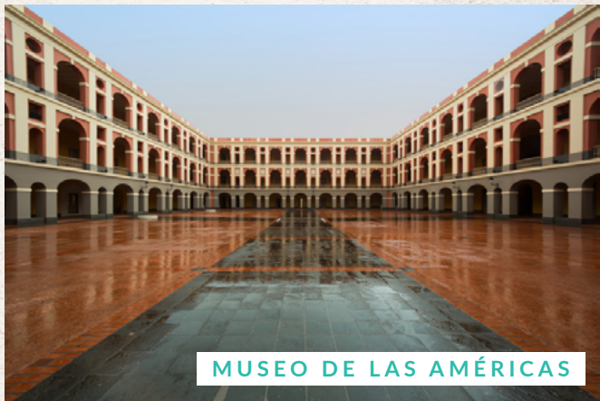
MUSEO DE LAS AMÉRICAS