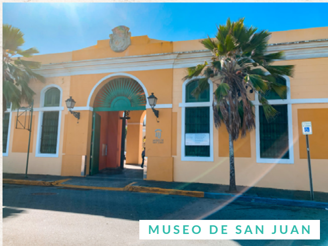
MUSEO DE SAN JUAN

150 Calle Norzagaray, San Juan, 00901, Puerto Rico | 787-480-3547 discoverpuertorico.com