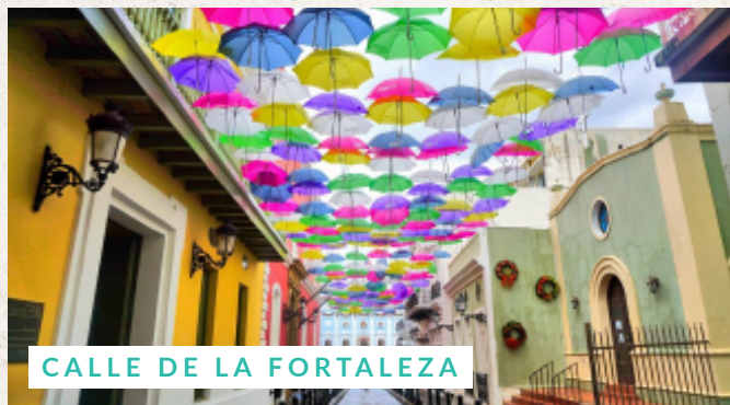
CALLE DE LA FORTALEZA