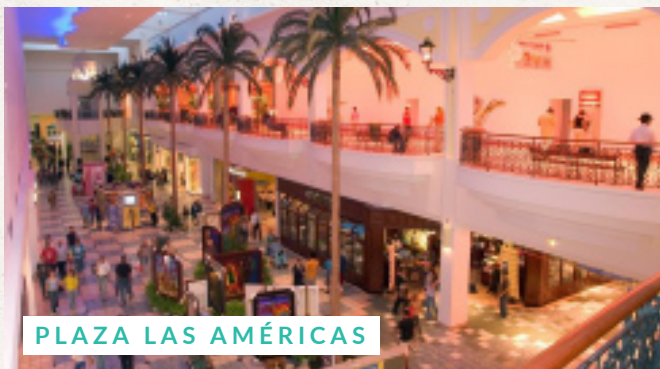
PLAZA LAS AMÉRICAS

105 Calle de la Fortaleza, San Juan, 00901, Puerto Rico 787.646.4943 la-calle-mall.business.site