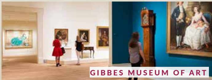
GIBBES MUSEUM OF ART

Patriots Point Development Authority was established in the 1970s to develop a naval & maritime museum on Charleston Harbor with the World War II aircraft carrier, USS YORKTOWN as its centerpiece. It's also home to the Patriots Point Museum and a fleet of National Historic Landmark ships, the Cold War Memorial and the only Vietnam Experience Exhibit in the U.S., the Congressional Medal of Honor Society, and the agency's official Medal of Honor Museum. 40 Patriots Point Rd, Mt Pleasant, SC 29464 (843) 884-2727