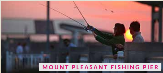
MOUNT PLEASANT FISHING PIER

North Charleston Wannamaker County Park is a nature-oriented park designed for family and group use. It offers over 1,015 acres of beautiful woodlands and wetlands, and provides guests with a variety of activities. Miles of paved trails allow for exploration of the area's beautiful natural resources. 8888 University Blvd, North Charleston, SC 29406 (843) 762-5585